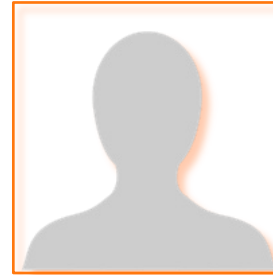
Open VP Career Development