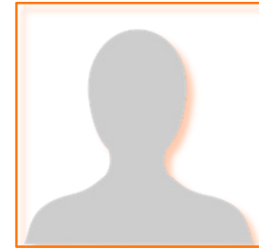
Open VP Marketing & Communications